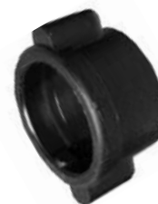
Winged Coupling Ring W/6482