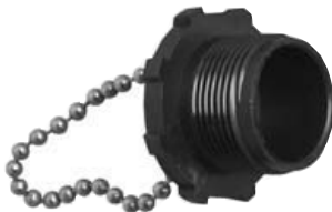
Cable Cap 4XX96