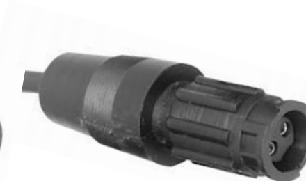
Cable to Cable