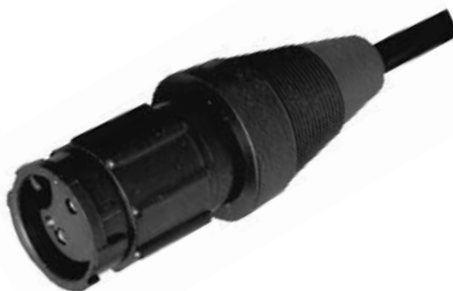
Cable to Cable