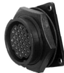
Panel Mount 24XXX-XXXG-XXX Matching Mates: • Cable Pin 23X8X-XXPG-XXX • Cable Socket 23X8X-XXSG-XXX