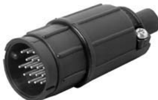
Cable to Cable 15X8X-XXXG-XXX Matching Mates: • Cable Pin 13X8X-XXPG-XXX • Cable Socket 13X8X-XXSG-XXX